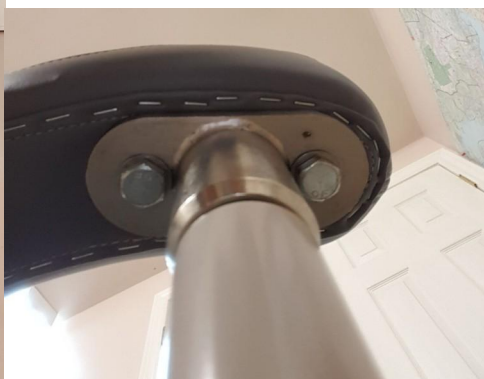
Underside of Ratcheting Mechanism